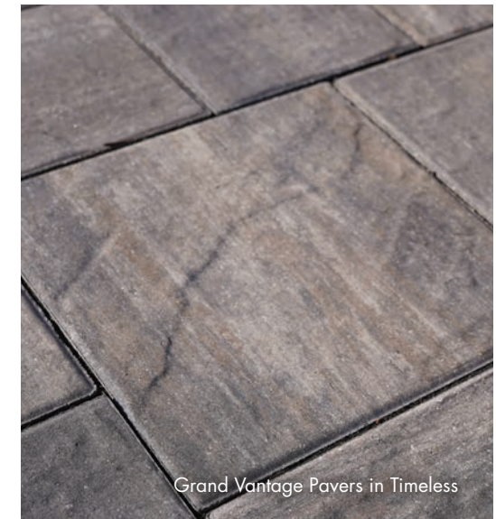
Grand Vantage Pavers in Timeless