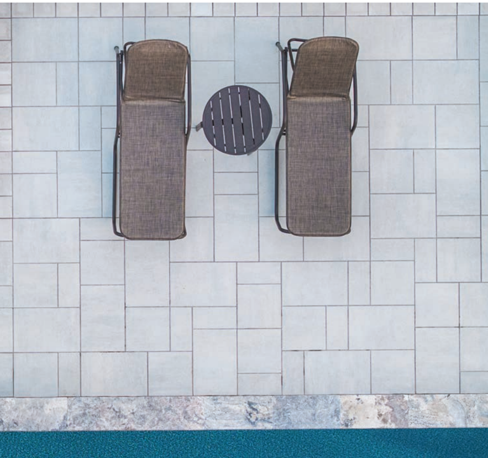
Grand Discover Pavers in Allure