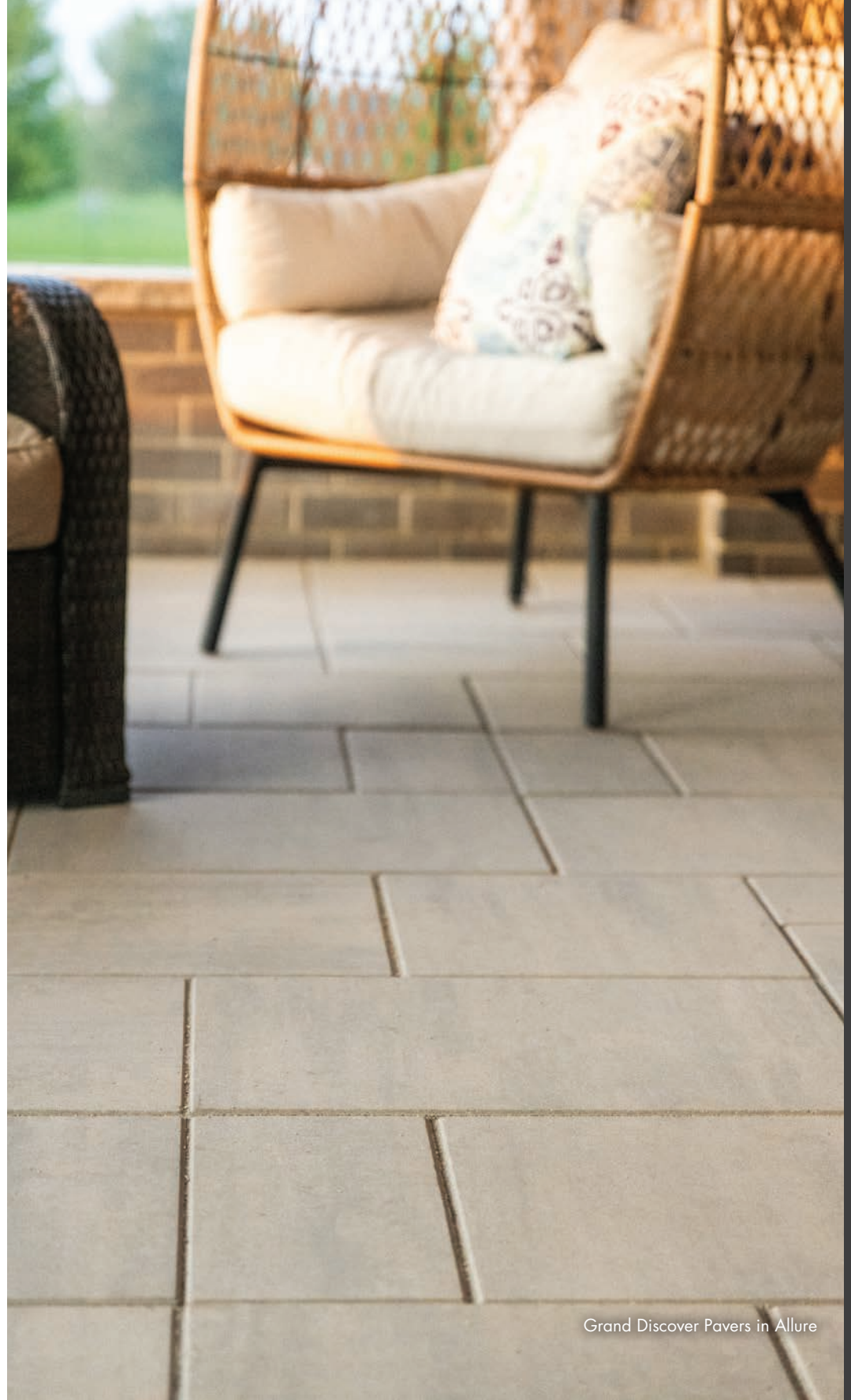
Grand Discover Pavers in Allure