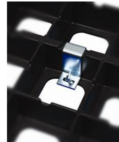
Figure 2 PADLOC® Connection Device