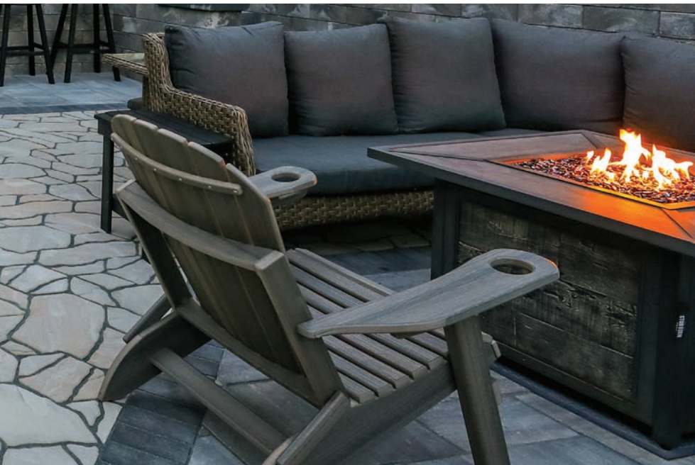
Destination Pavers in Intention, Grand Discover Pavers in Timeless, Elements Paving Stones (4x8) in Reflection, Tribute Smooth Retaining Wall System in Timeless