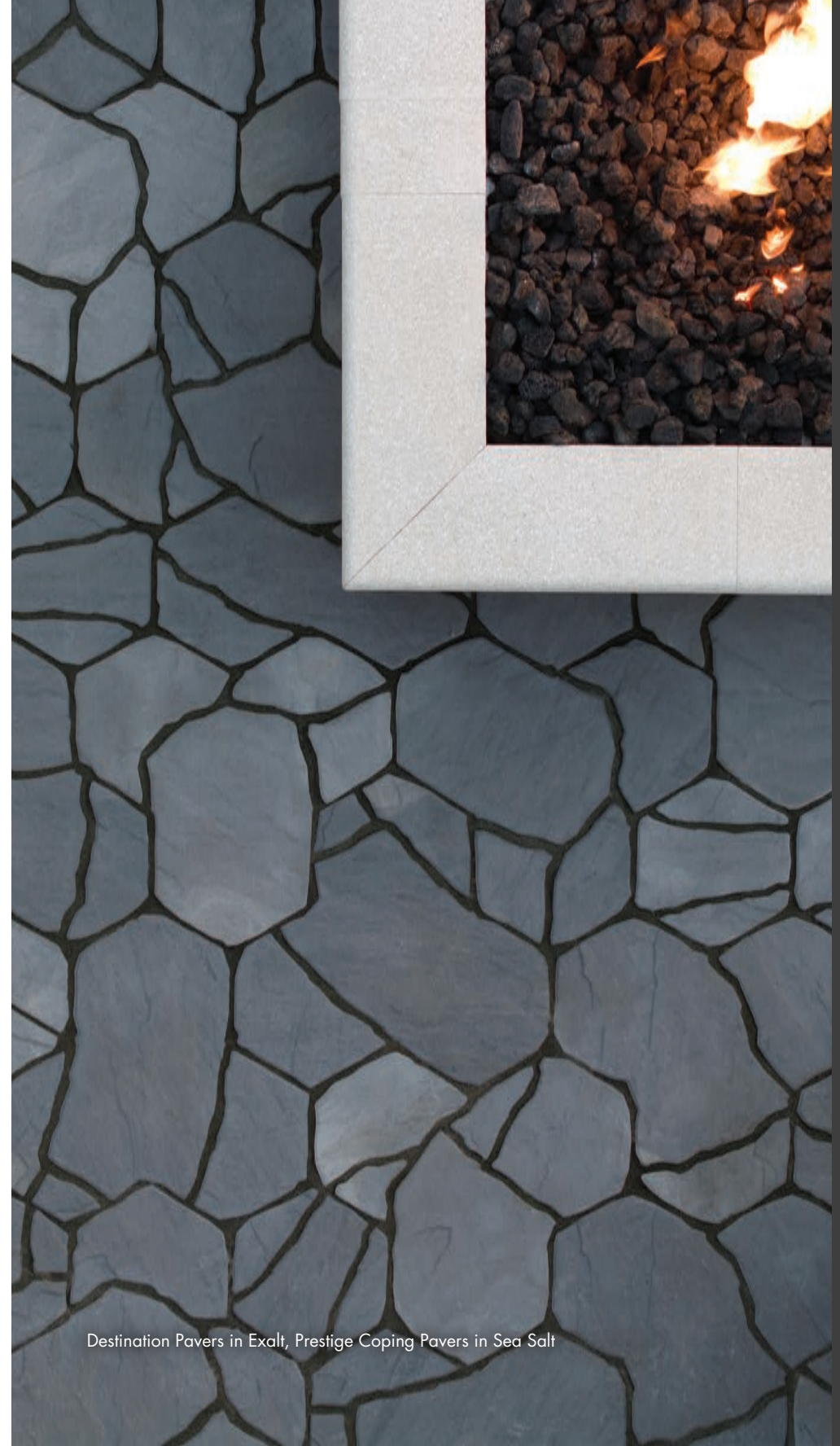
Destination Pavers in Exalt, Prestige Coping Pavers in Sea Salt