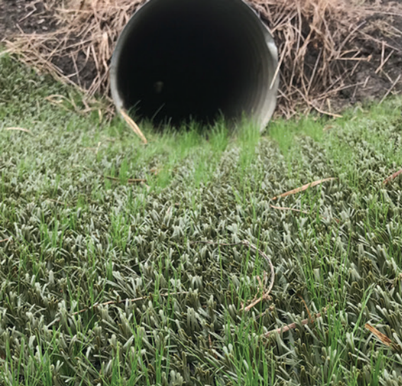
ShearForce12 with new vegetation growth protecting pipe outfall.